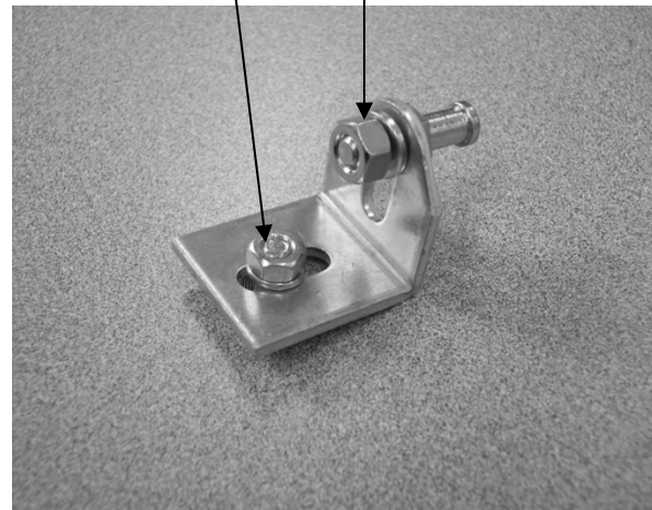
Lid Latch Assembly